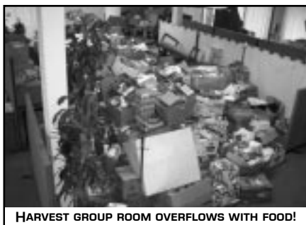
HARVEST GROUP ROOM OVERFLOWS WITH FOOD!

THROUGH THE OUTSTANDING GENEROSITY OF THE NORTH SHORE COMMUNITY AT CHRISTMAS, THE HARVEST PROJECT WAS ABLE TO