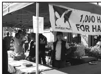
Harvest staff and volunteers man the BBQ booth.

Many community businesses and organizations request the volunteer support of Harvest Project and in return donate a portion of the proceeds to us. During the last quarter our staff and volunteers offered their time and assistance to: